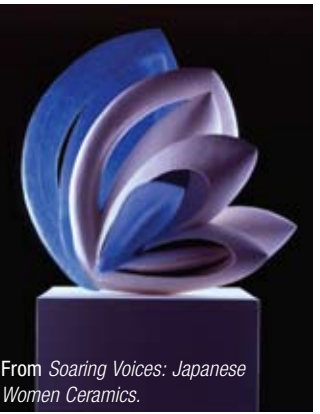
From Soaring Voices: Japanese Women Ceramics.