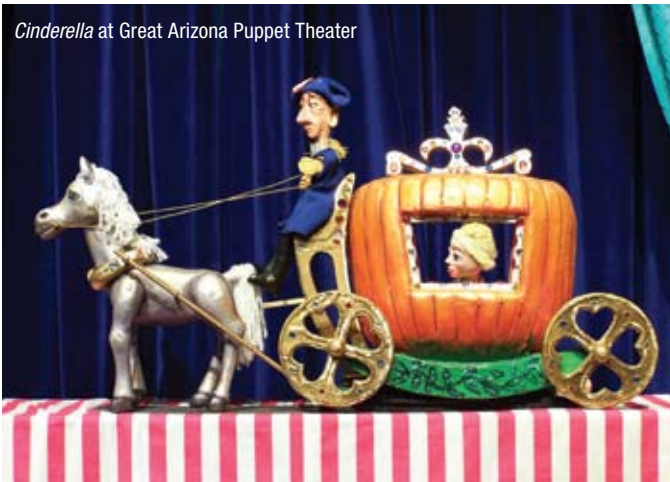
Cinderella at Great Arizona Puppet Theater