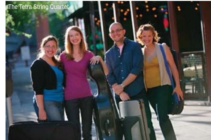
The Tetra String Quartet