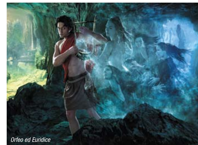
Orfeo ed Euridice

Arizona Opera www.azopera.org Tucson: 520-293-4336 Oct. 1 - 2 Cavalleria Rusticana/Pagliacci Nov. 19 - 21 Faust Feb. 4 - 5 Madama Butterfly March 3 - 4 Aida April 21 - 22 Orfeo ed Euridice Phoenix: 602-266-7464 Oct 7 - 9 Cavalleria Rusticana/Pagliacci Nov. 11 - 13 Faust Jan. 27 - 29 Madama Butterfly March 9 - 11 Aida April 13 - 15 Orfeo ed Euridice